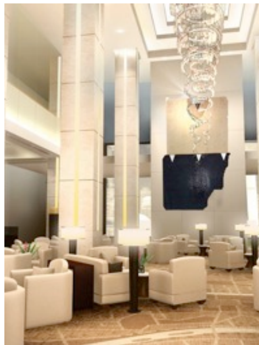
LEFT: Le Meridien Resort in Chiang Rai