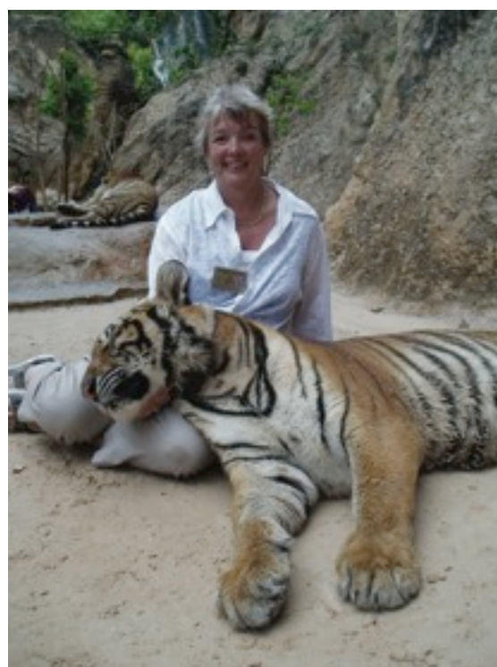
LEFT: Chiang Mai Night Market