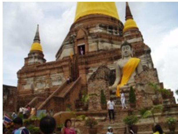
ABOVE: Ancient Thai Temple