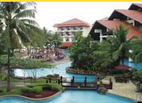
Magellan Hotel www.suteraharbour.com