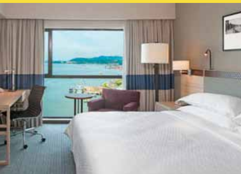
Four Points Sheraton Hotel www.starwoodhotels.com/fourpoints